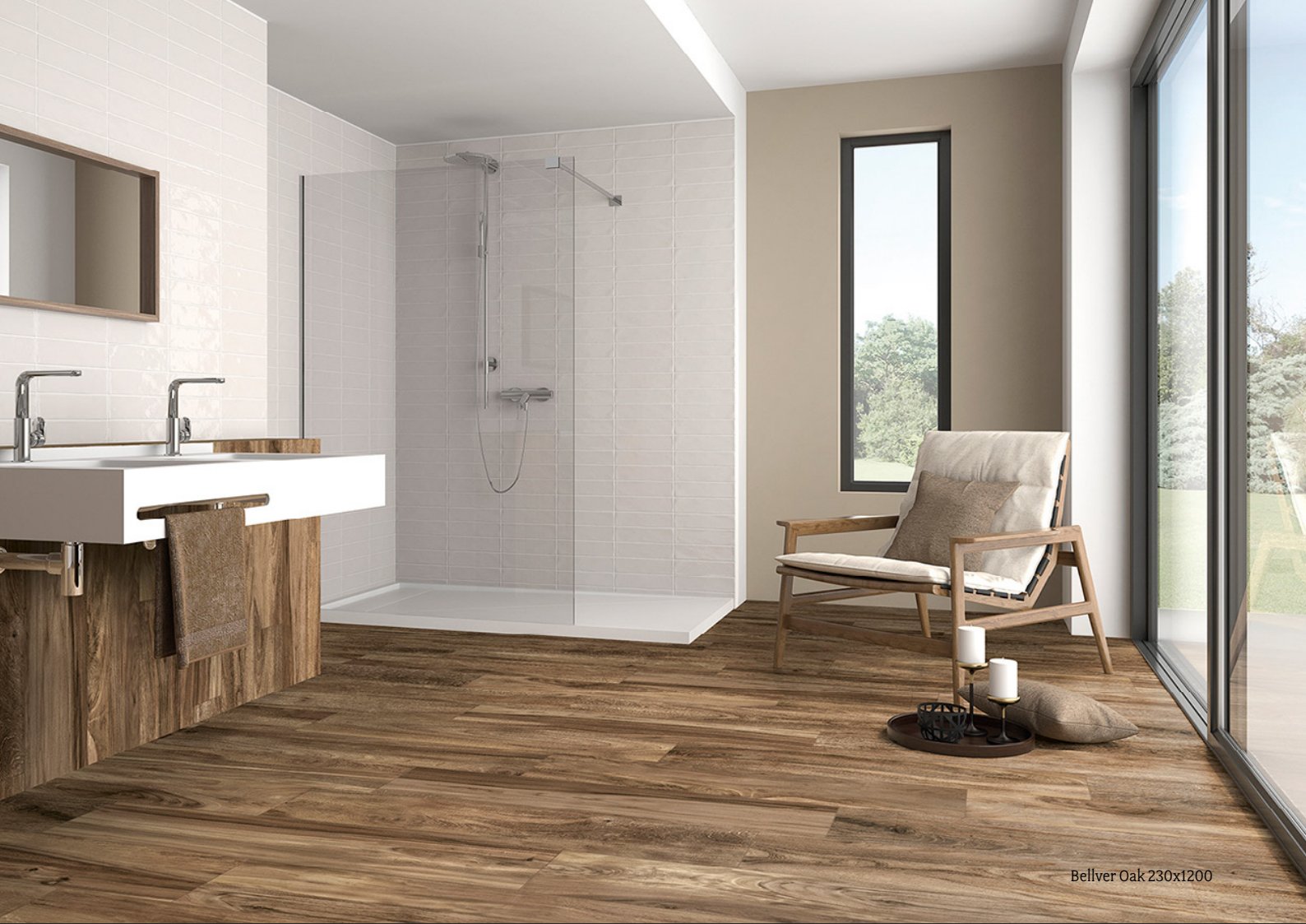
Bellver Oak 230x1200