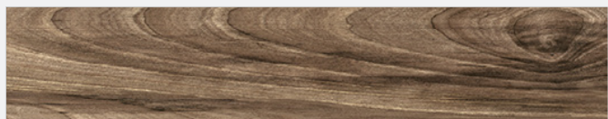
BELLVER OAK 230X1200