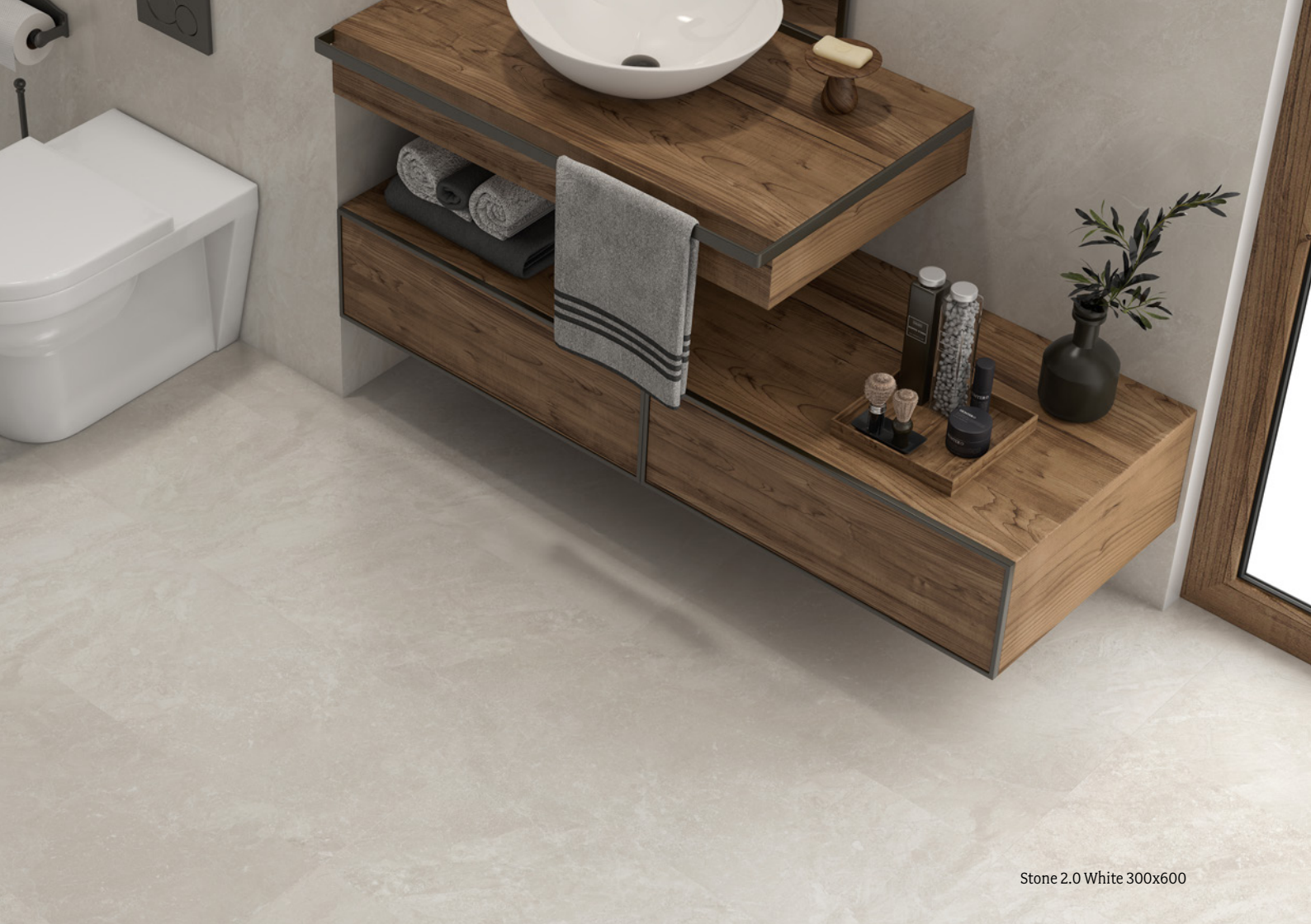
Stone 2.0 White 300x600