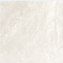
STONE 2.0 WHITE 300X300