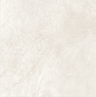
STONE 2.0 WHITE 500X500

STOWHI5050M - STONE 2.0 WHITE MATT STOWHI5050X - STONE 2.0 WHITE EXTERNAL