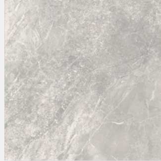
STONE 2.0 GREY 500X500

STOWHI5050M - STONE 2.0 WHITE MATT STOWHI5050X - STONE 2.0 WHITE EXTERNAL