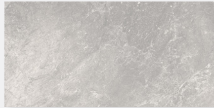
STONE 2.0 GREY 300X600